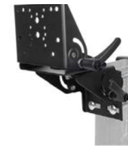
7160-0366 Dual clam shell with small backer plate