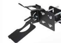
7160-0499 Barcode scanner/mobile computer mount - upper and lower