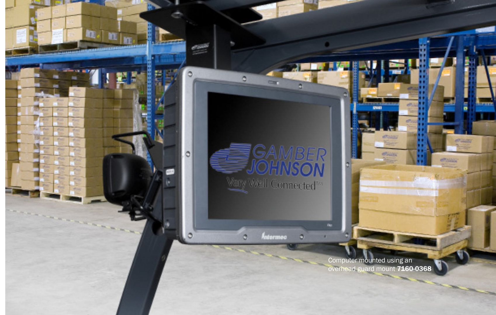
Computer mounted using an overhead guard mount 7160-0368