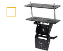
7160-0586 Short overhead guard mount with dual clam shell