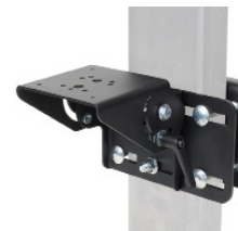
7160-0370 Clam shell with large backer plate