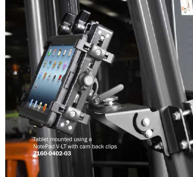
Tablet mounted using a NotePad V-LT with cam back clips 7160-0402-03

Your Gamber-Johnson products are assembled, packaged, and shipped from our plant in Wisconsin. This typically takes only 72 hours - one of the fastest turn-around times in the industry.