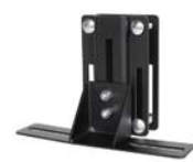
7160-0611 Dual safety light bracket (fits most brands of safety lights)