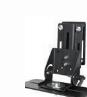
7160-0609 Dual safety light bracket with clam shell (fits most brands of safety lights)