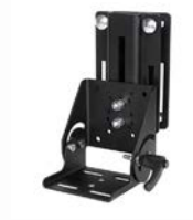
7160-0608 Single safety light bracket with clam shell (fits most brands of safety lights)