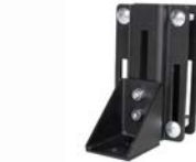
7160-0610 Single safety light bracket (fits most brands of safety lights)