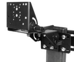
7160-0421 Dual clam shell with 3" arm - large backer plate