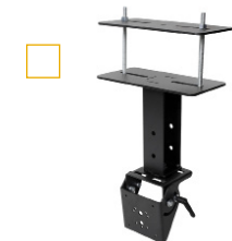
7160-0368 Extended overhead guard mount with clam shell