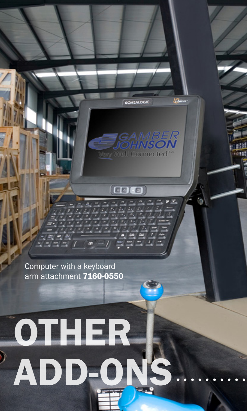
Computer with a keyboard arm attachment 7160-0550