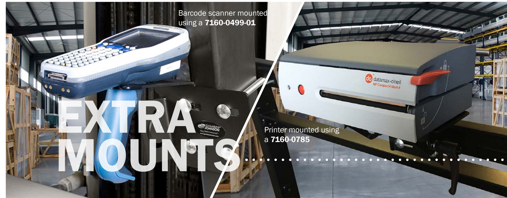
Barcode scanner mounted using a 7160-0499-01