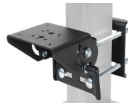
7160-0357 Clam shell with small backer plate

This mount features a 3" arm between the two clam shells which helps to bring the device closer to you. The arm adds an additional swivel point allowing you to position the device at the optimal ergonomic position.