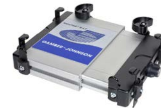
7160-0402-03 NotePad V-LT universal computer cradle with cam back clips