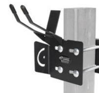
7160-0499-01 Barcode scanner/mobile computer mount - upper only

The combination mount has the upper mount plus an adjustable lower section that can be moved into the position you desire.