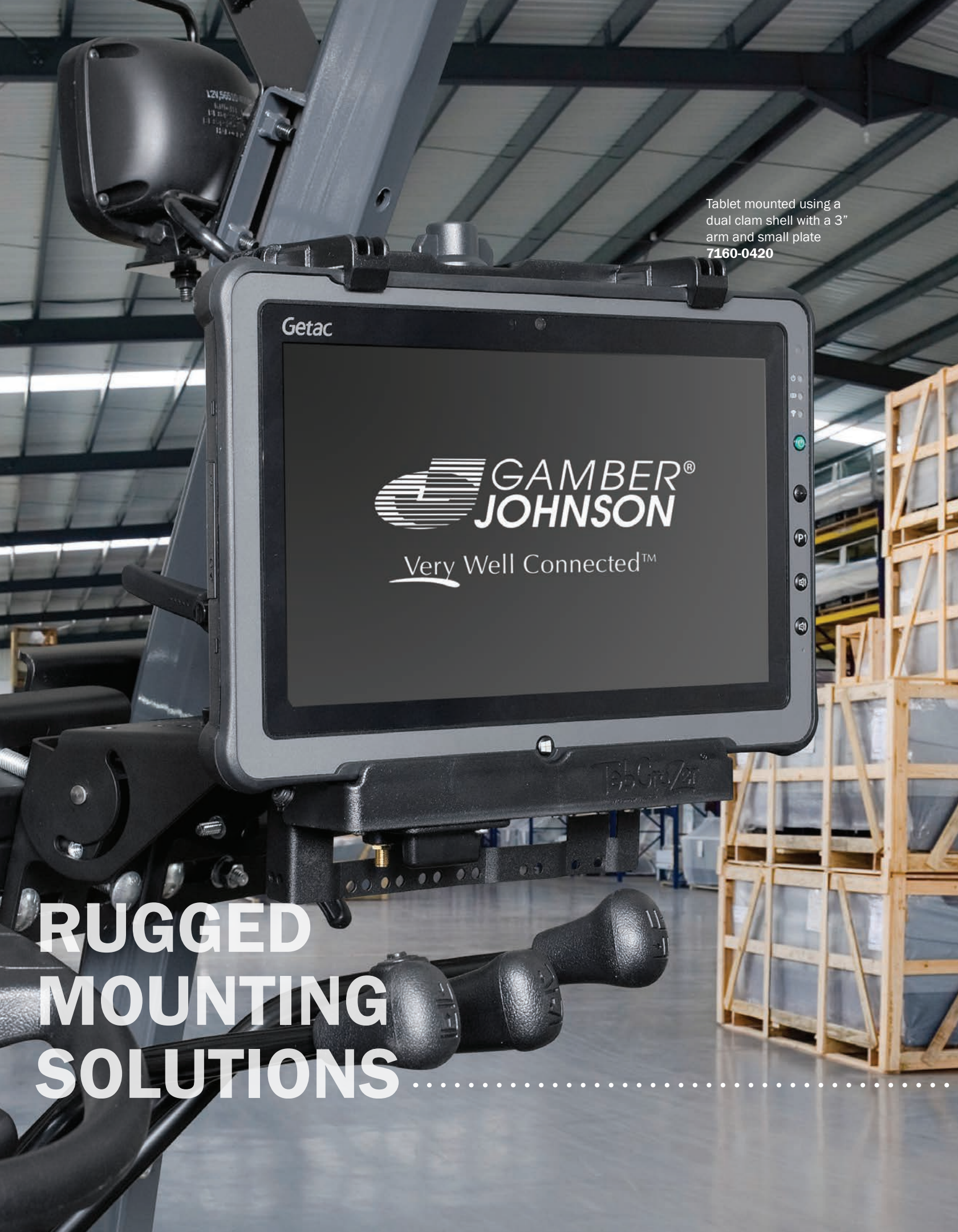
Tablet mounted using a dual clam shell with a 3" arm and small plate 7160-0420