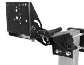
7160-0420 Dual clam shell with 3" arm - small backer plate