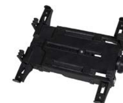
7160-0774 TabCruzer Mini - universal tablet cradle