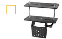
7160-0585 Short overhead guard mount with single clam shell

Brings your device further down 8" down off the overhead guard for easier viewing.