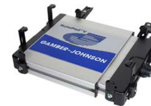
7160-0402-01 NotePad V-LT universal computer cradle with zero edge clips