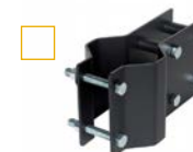
7160-0561 2", 2.5", or 3" diameter tube clamp

The tube clamp can be used with small or large clam shells, dual clam shells, dual clam shells with 3" arm, barcode/handheld computer mounts, or the horizontal extension bracket. The tube clamp allows the clam shell to be mounted in a horizontal or vertical orientation.