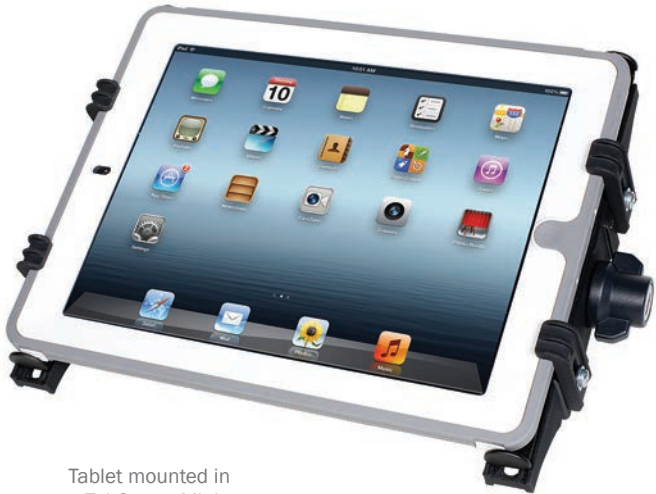
Tablet mounted in a TabCruzer Mini 7160-0774

Every day, we work with people like operations managers, warehouse managers, and IT managers to pick out the right solution for their unique material handling needs. Send us an email or drop us a line and we'll help you come up with a solution that fits your budget, time line, and vehicles.