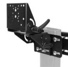
7160-0367 Dual clam with large backer plate